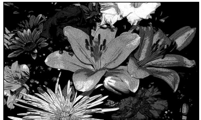
Value study using a posterizing filter