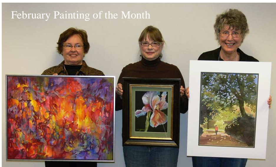
February Painting of the Month